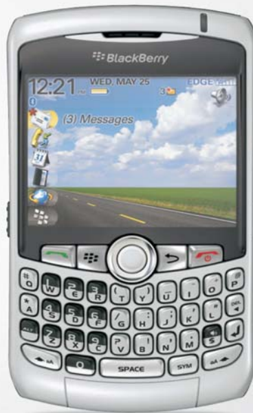
BlackBerry® Curve™ 8300 smartphone