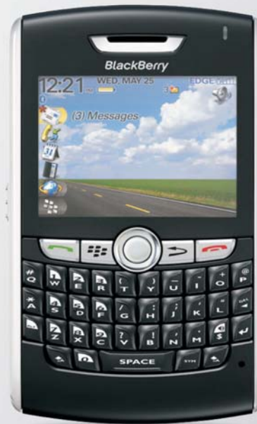
BlackBerry® 8800 smartphone

You can have everything you want in your BlackBerry® smartphone and stay connected at all times with your friends and family, business, entertainment and the whole world, without limits.