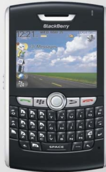
BlackBerry® 8800 smartphone

You can have everything you want in your BlackBerry® smartphone and stay connected at all times with your friends and family, business, entertainment and the whole world, without limits.