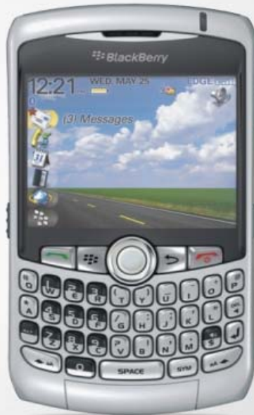
BlackBerry® Curve™ 8300 smartphone